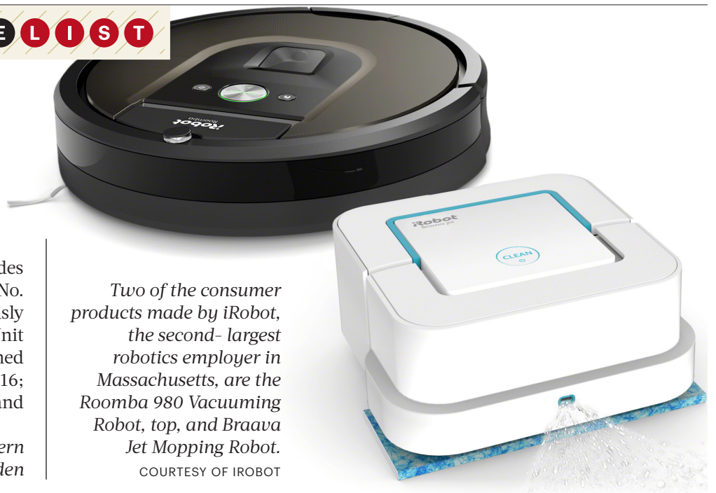
Two of the consumer products made by iRobot, the second-largest robotics employer in Massachusetts, are the Roomba 980 Vacuuming Robot, top, and Braava Jet Mopping Robot.